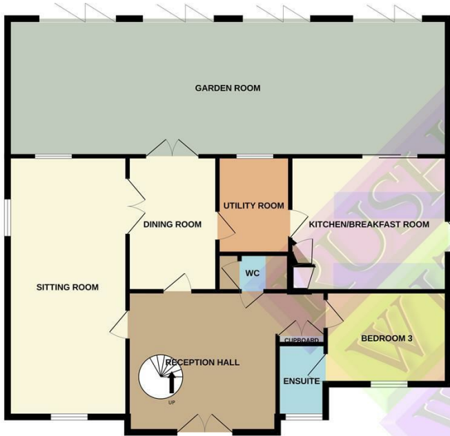
GROUND FLOOR 1389 sq.ft. (129.1 sq.m.) approx.