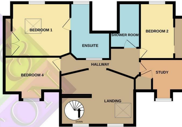
1ST FLOOR 723 sq.ft. (67.2 sq.m.) approx.